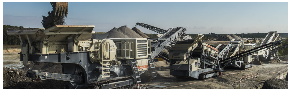
Easy to combine with other Lokotrack.