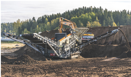
Aggressive stroke for sticky material.

*Capacity depends on application (required end products, feed material characteristics and size, moisture etc.)