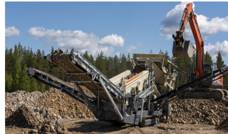
World class expertise for tailored options.