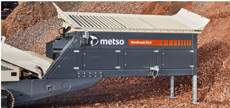
Robust tipping grid with remote controllable tilting. Possibility to offer also vibrating grid