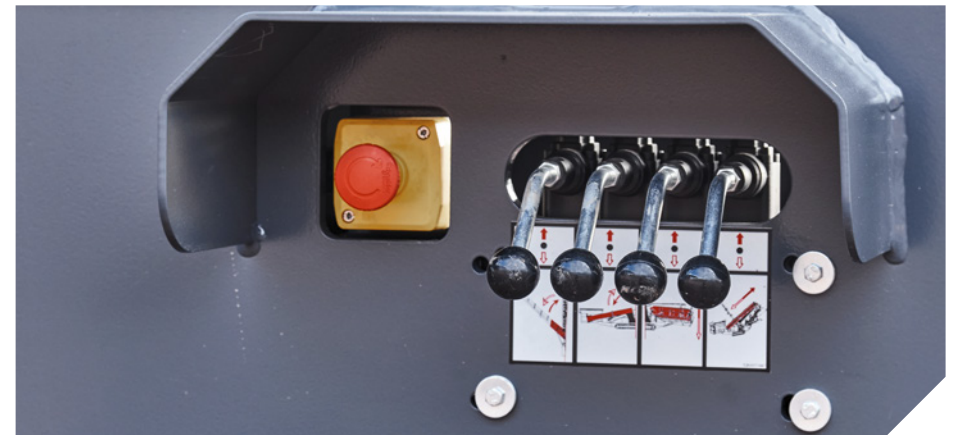
Six emergency stops, start siren, engine shutdown system and nip point guards for safety